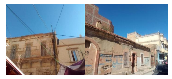
Fig. 2. Degradation of the colonial building of the old center of the city of Ain-Beida

Residential mobility contributes to the dynamics of the city by setting space in motion and transforming its form and/or function. Homeowners may leave their homes due to changes in ownership status, location, type of housing or size. The development of the transport system, including means of travel and road infrastructure, is also a significant factor in driving the dynamics of the city. In addition, the migratory movement of the population from outside the city also contributes to the city's dynamics. In the case of Ain-Beida, its strategic location as an urban crossroads between several important cities in eastern Algeria, such as Tébessa-Constantine and Guelma-Khenchela, has led to a strong movement of the population from neighboring areas in search of better living conditions. This is due to the presence of services and equipment and the diversity of commercial activities, making the city a center of employment and a place of convergence of flows.