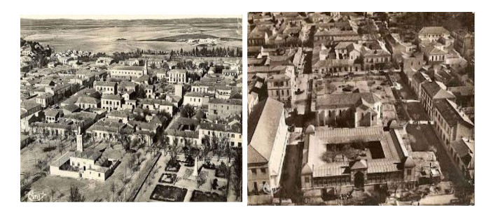
Fig. 3. The orthogonal layout of the roads in the colonial center of the city of Ain-Beida

The colonial core of Ain-Beida city is located in its old center. It was designed based on the European model, with a checkerboard plan. This type of plan has been used since ancient times as the most commonly used geometrical scheme for organizing colonized territories (Hinda and al, 2014, op cit). The constructions in this area have limited heights and are often residential in character, mostly on the first floor (as shown in figure 3). Being located at the intersection of the two main roads RN 10 and RN 80, the colonial core has a central position in the whole urban structure of the city. This gives it good accessibility and makes it a place of attraction for the resident population and visitors from outside (as shown in figure 4). Thanks to these favorable spatial conditions, the government adopted a market economy policy towards the end of the 1980s, which encouraged the massive installation of commercial and service activities in the area. This has led to an increase in land values and a high economic return, which in turn encouraged residents to make changes to their homes. As a result, a significant number of residences have undergone physical and/or functional transformations, which can be either partial or radical.