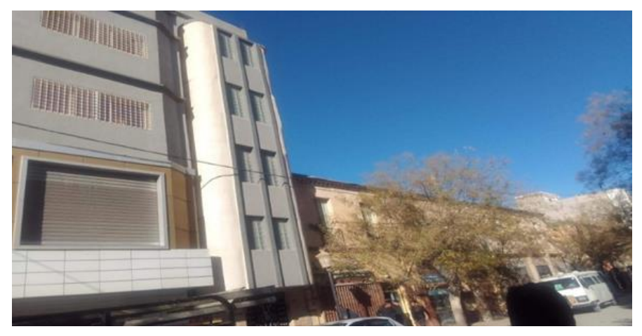
Fig. 6. Conversion of residential buildings to administrative offices