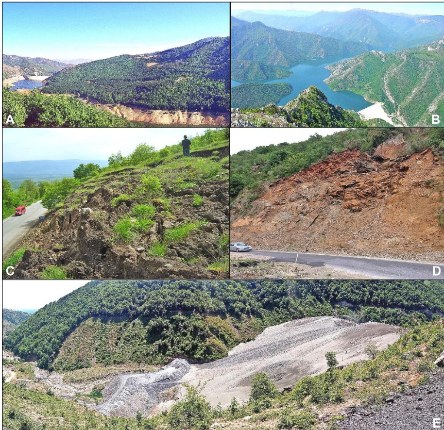
Fig. 3. Threats to geodiversity through: A. intensified erosion along a newly formed coastal zone (Glažnja reservoir); B. Immersion of cliff and canyon parts with karst relief (accumulation Kozjak); C. Activation of landslide near the village of Stracin; D. Activation of rockfalls near the village of Kalimanci; E. Formation of a large tailing site in the valley of Kamenička River.