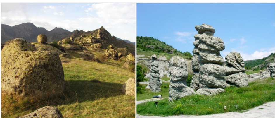
Fig. 2. Protected geomorphological sites – natural monuments. left: denudation landscape at Markovi Kuli near Prilep (placed on the UNESCO World Heritage Tentative List); right: the earth pyramids at Kuklica near Kratovo.

In the geological structure of several mountains, gneisses, granites, granodiorites, andesite, ignimbrites and other rocks which are prone to denudation are dominant. Therefore, a denudation relief is present on them, which in many places is unusually expressed. Particularly remarkable occurrences of denudation landscape (boulders, stone walls, small denudation forms, chaos from blocks, etc.) are found on the Selečka Mountain (1,471 m), the Babuna range with Zlatovrv (1,422 m), the eastern branches of the Mokra Massif, the southern slopes of Ogražden (1,745 m), the southern slopes of Kozjak (1,355 m) to Stracin, mountain Mangovica (Milevski & Miloševski, 2008) and others. The denudation landscape of these mountains, in particular the Selečka Mountains and Zlatovrv, (Markovi Kuli site) constitutes a large complex with numerous and extremely diverse forms (Fig. 2) for which it has been considered as internationally unique (Kolčakovski & Milevski, 2012). These and other areas with a typical denudation relief are very important for the geomorphological heritage of the Republic of Macedonia and as such 12 new sites are recognized and should be fully protected, properly managed and promoted.