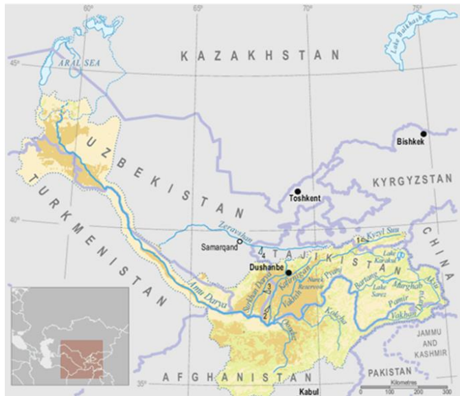
Fig. 1. Amu Darya Basin, Turkmenistan

The Amu Darya Basin, also known as the Amu Darya basin, is a large depression located in the western part of Central Asia (Figure 1). It encompasses parts of Turkmenistan, Uzbekistan, Afghanistan, and Tajikistan. The basin is formed by a cratonic depression filled with thick sedimentary rock layers. The Amu Darya River, one of the longest rivers in Central Asia, flows through the basin. Its source is in the Pamir Mountains, and it flows northwest into the Aral Sea. The Amu Darya Basin is an important agricultural region, with cotton being the main agricultural crop grown here. However, cotton field irrigation reduced the flow of the Amu Darya River, resulting in the rapid drying up of the Aral Sea.